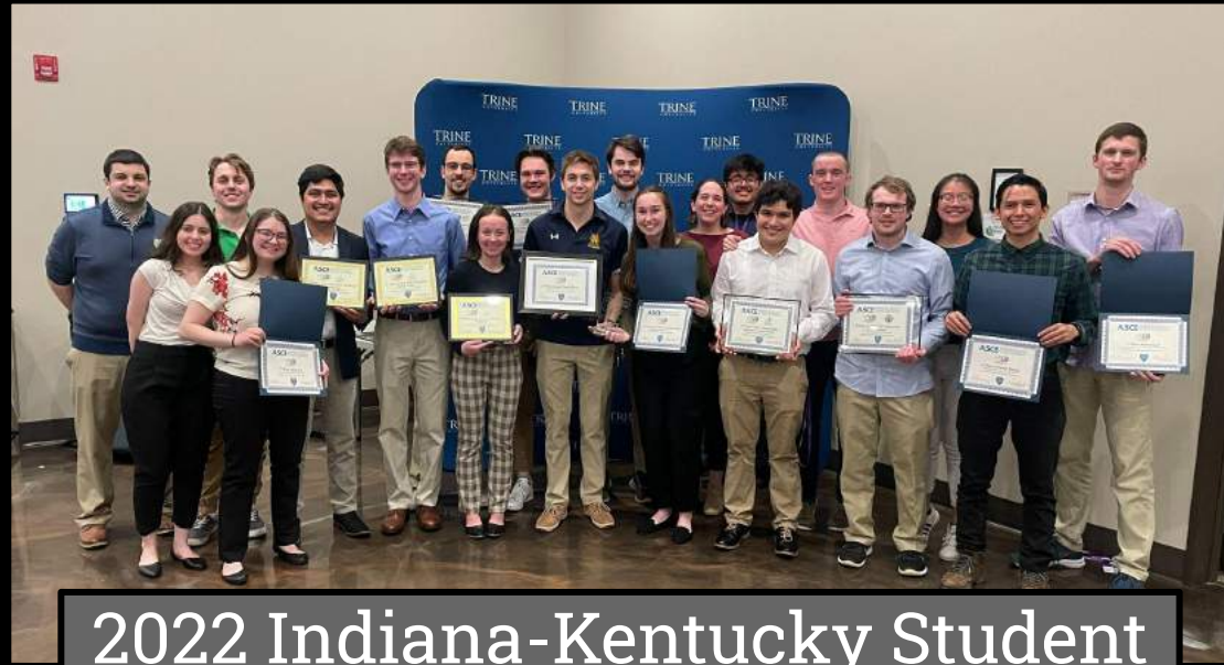
2022 Indiana-Kentucky Student Symposium Champions